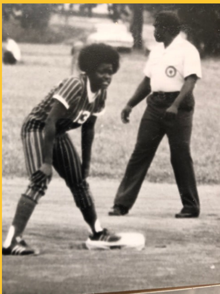
Playing in the Army softball league in Germany in the late 1970s.