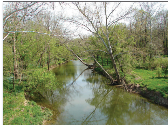
Figure 1. Clifty Creek is in south-central Indiana.

IDEM used CWA section 319 funds to support three projects in the greater Clifty Creek watershed between 2003 and 2009. Watershed stakeholders worked with local and state agencies to develop a