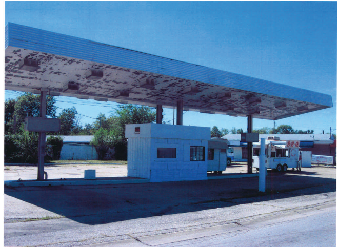
Former BP Ellis Site, Jeffersonville

the IFA, in addition to revenues available within the Zone, to facilitate cleanup and Site reuse. The 0.33-acre vacant Site now owned by the City of Jeffersonville is located at the southwest corner of the intersection of Spring Street and Eastern Boulevard, which is a city "gateway" off of the