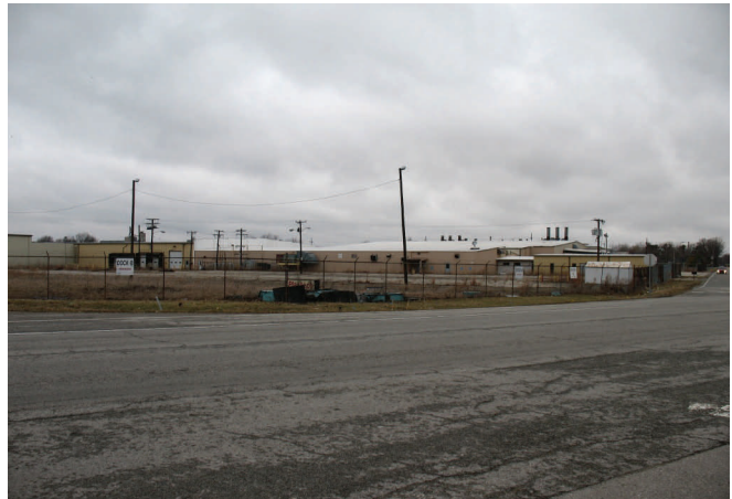
Former Plastech Engineering Products, Elwood

This facility produced plastic injection molded exterior automotive components and was a painting facility for Chrysler and General Motors until it closed in 2008. The Auto Sector Initiative award will fund the completion of Phase I