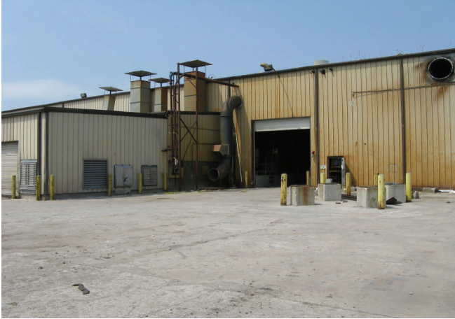
Former Fort Wayne Foundry Facility, Columbia City

A $95,000 Auto Sector Initiative award to the Fort Wayne Metals Research Products Corporation (Fort Wayne Metals) will be targeted at the former Fort Wayne Foundry Facility located at 2300 East Cardinal Drive in Columbia City. This facility manufactured aluminum sand castings for automotive engine components, particu-