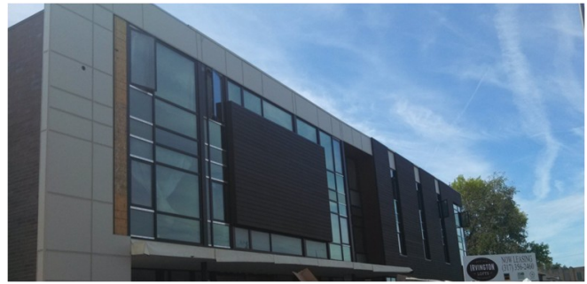
After: Irrington Lofts