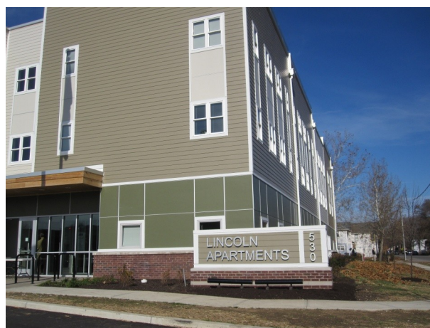
After: Lincoln Apartments, 530 North Holmes Avenue