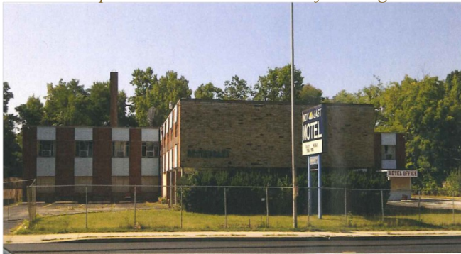
Before: Former Indy East Motel, 5585 East Washington Street