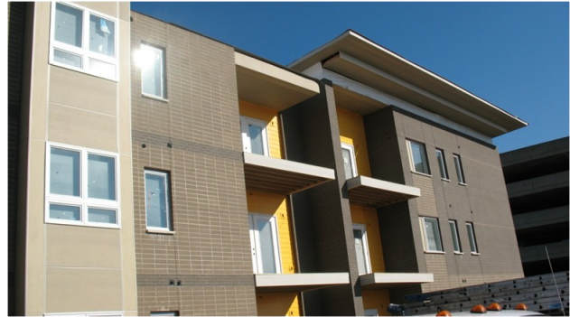
After: Illinois Place Apartments