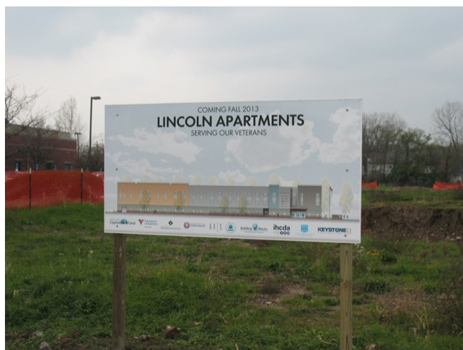
Before: Former National Malleable Castings Company, 2732 W Michigan Street/530 N. Holmes Avenue