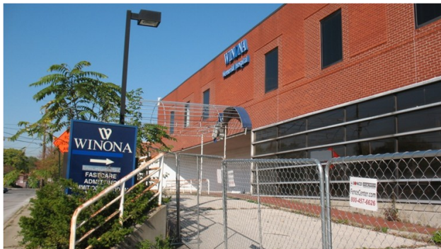
Before: Former Winona Hospital, 3232 North Meridian