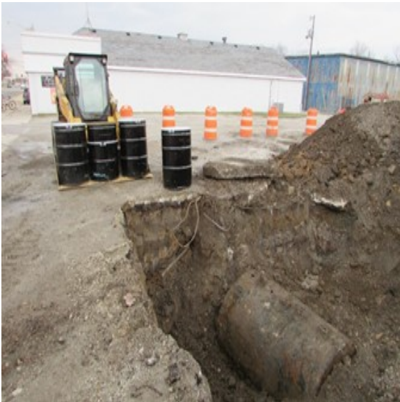
Southside Lumber, Kokomo – UST removal

of care that falls between independent living and skilled nursing care. Other amenities include a library, hair salon, fitness center and wellness programs, routine medical services, 24-hour trained staff and emergency call system, three nutritionally balanced meals per day, housekeeping and laundry services, and resident transportation. The facility is centrally located across from Foster Park and the Kokomo Senior Center. Pedestrian extensions are planned to connect the Kokomo Residential Care Facility to the nearby Industrial Heritage Trail and the Walk of Excellence which will complement the City's Master Plan. On June 28, 2018, a Grand Opening was held for the Kokomo Residential Care Facility, called Silver Birch of Kokomo.