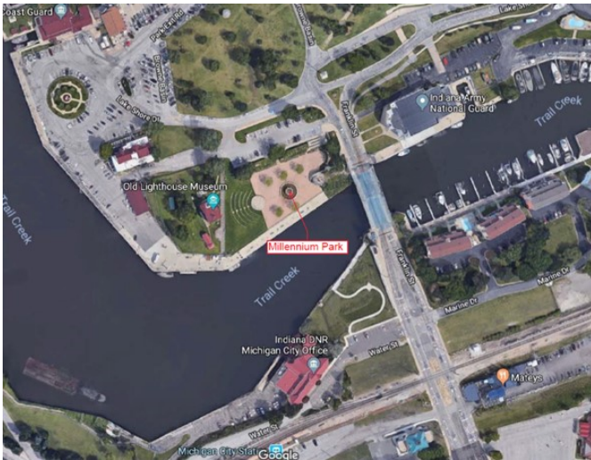
Millennium Park, Michigan City – location of press conference for U.S. EPA grant funding