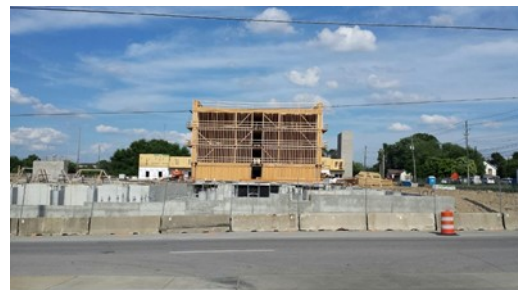
Construction of The Vue at former Perfection Paint, Indianapolis – 2016