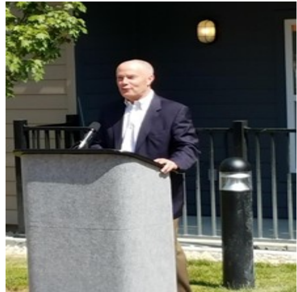
Indianapolis Mayor Joe Hogsett speaking at The Vue Grand Opening – 2018