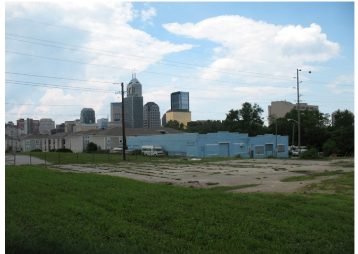
Location of former Perfection Paint, Indianapolis – 2014