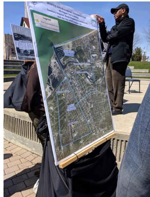
Michigan City target area display at press conference for U.S. EPA grant funding