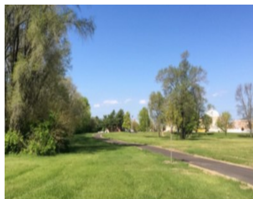
Former Columbus Wood Treating Plant redeveloped as pedestrian/cycling trail, Columbus.