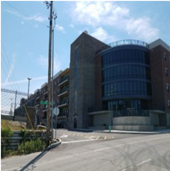
The Vue Grand Opening, Indianapolis – 2018