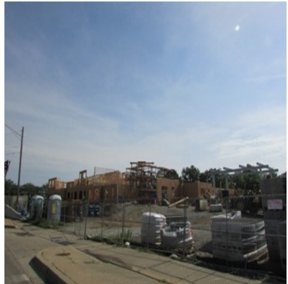
Southside Lumber/Kokomo Residential Care Facility, Kokomo – under construction