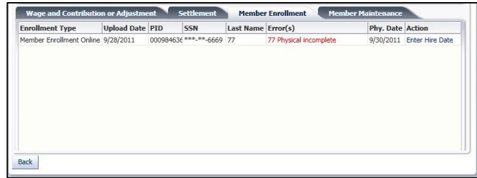
Figure 4: Member Enrollment Exception Queue