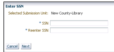
Figure 2: Intermittent Screen